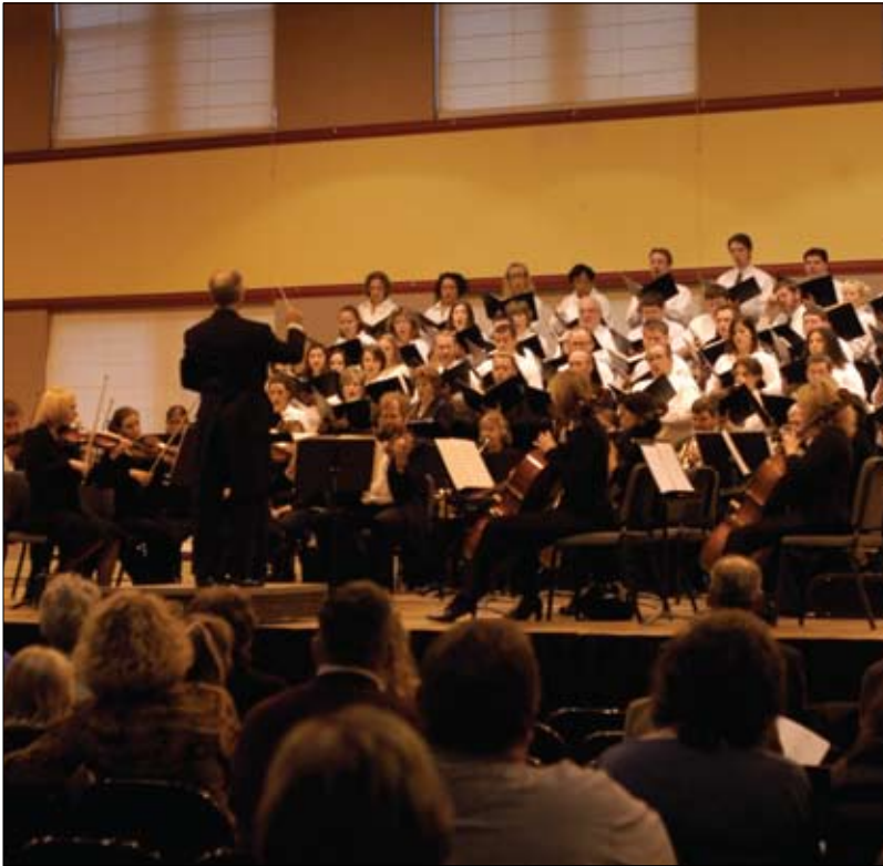
From the 2006-07 Season, Mozart 125th