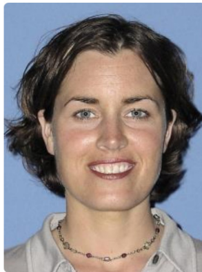
Current Account Picture

If you have issues with the portal, please email your photo for approval: CampusCardServices@fairmontstate.edu