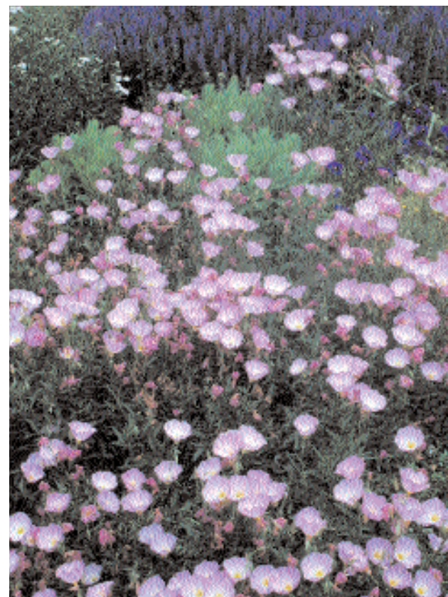
Meadow Sage (Salvia pratensis) is the background for New Mexico Evening Primrose (Oenothera berlandieri 'siskiyou')