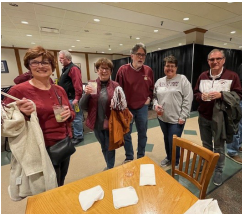
2024 Wheeling Mountain East Conference Basketball Tourney

Exciting Alumni Highlights from the 2023-2024 Academic Year