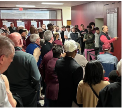
Unveiling of Basketball Leader Boards in the Feaster Center