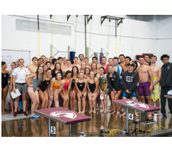
Alumni swim meet during 2023 Homcoming