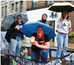
A little rain didn't stop the 2023 Homecoming parade