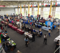
2024 Encova Career Development Center Career Fair