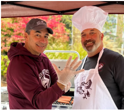
Alumni Association & the President's Office collaborated on a free hot dog lunch for students