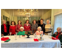
Gamma Chi Chi Christmas Luncheon