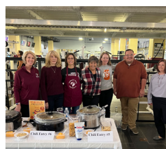
United Way Chili Cookoff