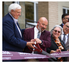
Middle College Ribbon Cutting