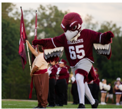
The New & Improved Freddie the Falcon