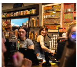
Homecoming Social Hour at The Joe