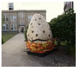
Freddie the Falcon hatching