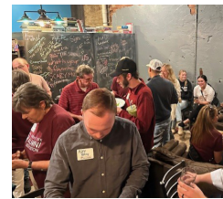
NCWW Next Gen Kick-Off Event