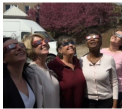
Solar Eclipse Viewing on Campus