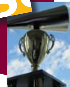
FSU's Acrobatics and Tumbling team participated in the First-ever national championships in 2011. Over the years when the sport was known as cheerleading or competitive cheer, FSU won six national championships.

FSU values scholarship, opportunity, achievement and responsibility. As a student here you'll find opportunities to achieve your professional and personal goals and discover roles for responsible citizenship that promote the common good.