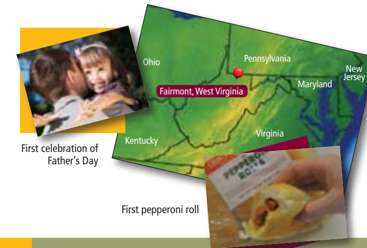
First celebration of Father's Day