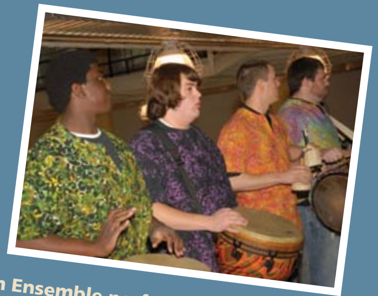
African Drum Ensemble performs in the Falcon Center

YOU LIKE TO TRAVEL. Participating in a national debate tournament, a choir concert in Russia, a theatre festival competition or a trip to a major museum of art, you will see the world.