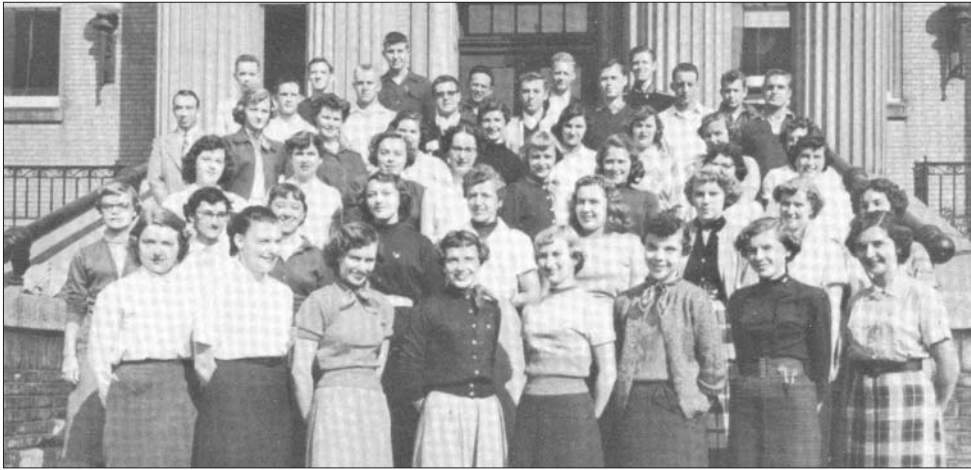
Class of 1955 Inductees: